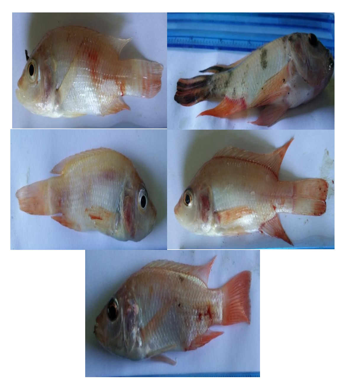
Figure 3 . Ulceration, lesion, and reddening of gills and fins of Red tilapia Oreochromis sp. infected with Aeromonas hydrophila .