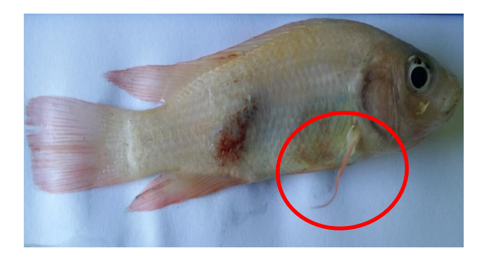
Figure 2 . Coloration changes on the peritoneal part of Red tilapia Oreochromis sp. after subjecting to Aeromonas hydrophila infection (circled).